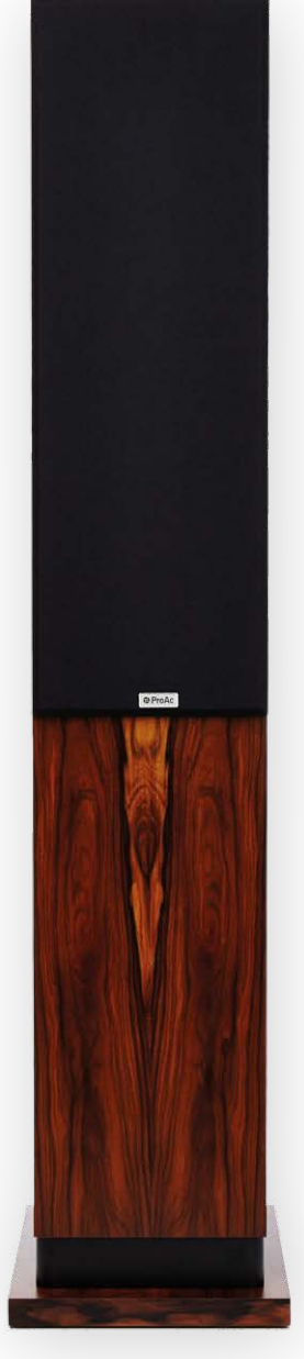
Shown in Rosewood veneer

The D48 spent a year in research and development before we were happy that it was good enough to go into production.