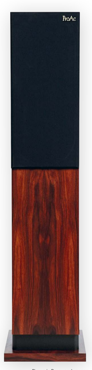
Shown in Rosewood veneer

The new Response D30 is the latest model to take advantage of the acoustic excellence of Pagina Mica which is reed leaves mixed with mica and coated with acoustic dope, thereby achieving levels of sound quality that were only dreamed of a few years ago.