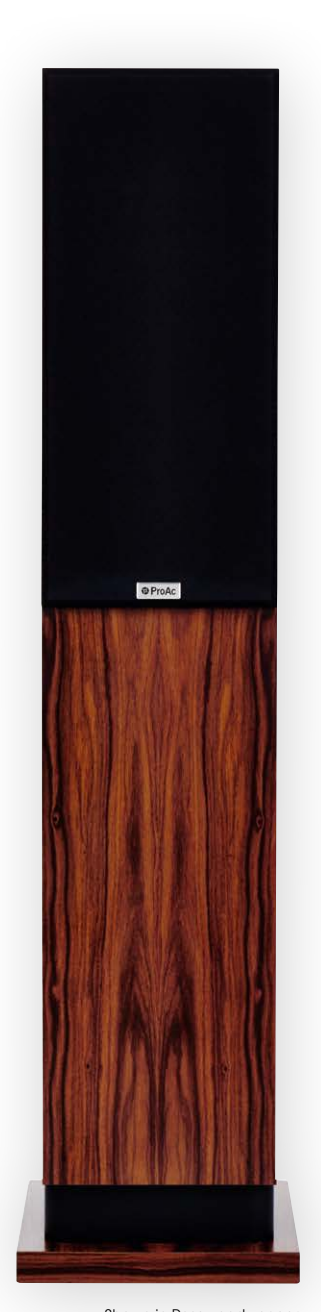
Shown in Rosewood veneer

The Response D18 proved to be one of ProAc's most successful loudspeakers, receiving critical worldwide acclaim but was only available with a dome tweeter. To satisfy demand for people wanting a ribbon tweeter ProAc has redesigned the D18 using an upgraded cabinet with new bass loading, new crossover network and the ProAc ribbon tweeter used in other ProAc models.