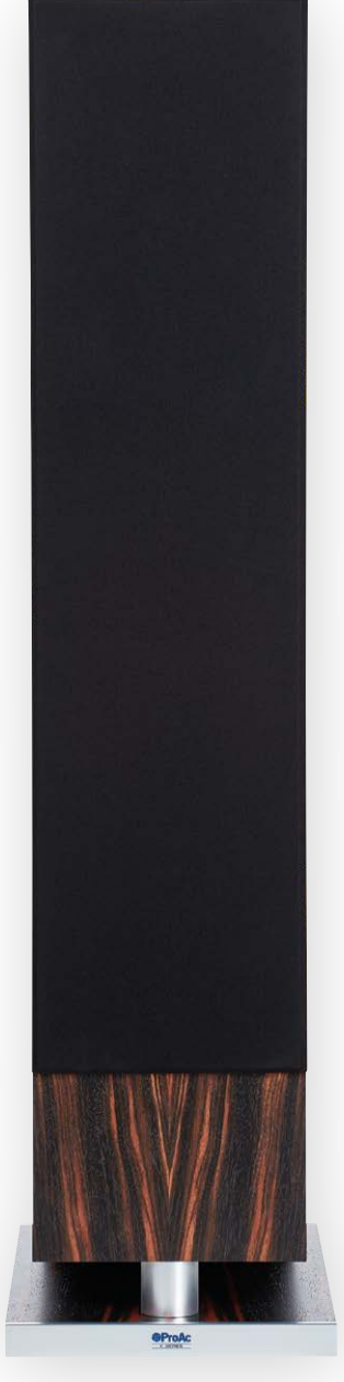
Shown in Ebony wood veneer