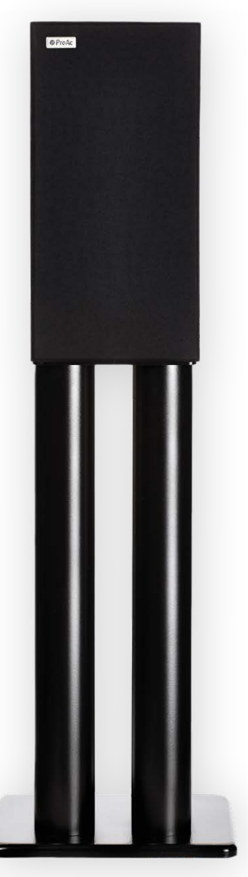
Shown in Black Ash wood veneer

The ProAc studio 100 was produced for over 20 years until 2013. They were made for both domestic and studio use. The studio 100 quickly became a favourite in studios, used as a near field monitor.