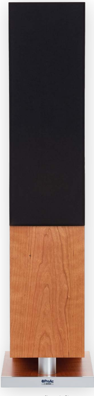
Shown in Cherry veneer

The K series range of speakers are called so because of the use of Kevlar in the construction of the drive units. So far we have only used Kevlar and Carbon Fibre for bass and lower midrange reproduction in large enclosures. These cones have a light, stiff quality, the Kevlar has more warmth making excellent bass transients and extension.