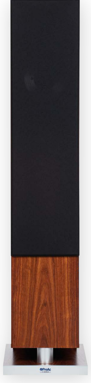
Shown in Rosewood veneer

Kevlar benefits from having similar properties to carbon fibre, being light and at the same time rigid. The ProAc 6 1/2" drivers utilised in the K6 feature Kevlar cones. The cone is painstakingly produced from a mould by hand, a labour intensive process taking many hours to complete.