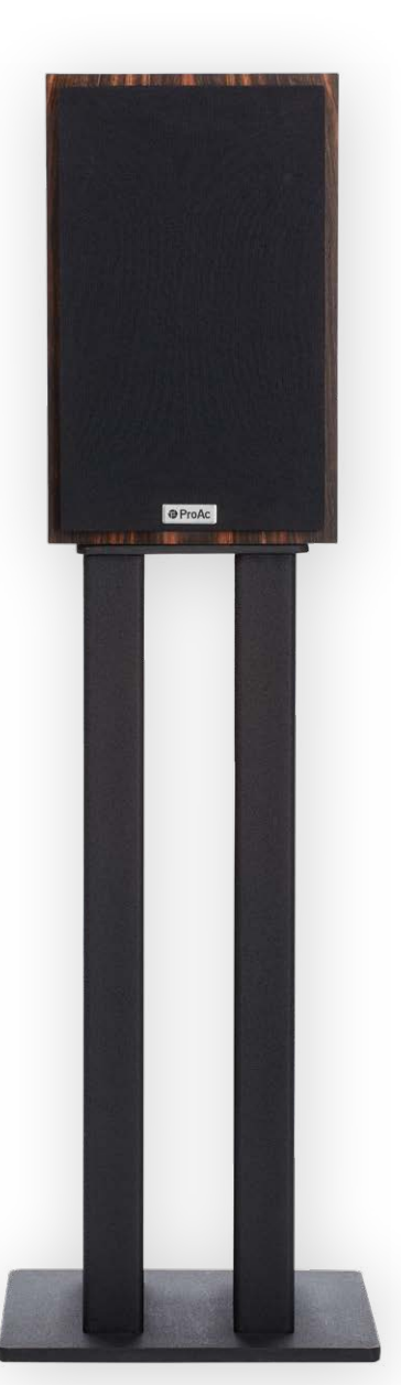
Shown in Ebony wood veneer

Following the successful launch of the ProAc Tablette 10 we have been developing a Tablette 10 Signature version. It has taken a great deal of time to design a new bass driver with Excel magnet system and our own solid copper phase plug. The result is a bass driver with the Tablette 10 cone material and our special copper magnet system.