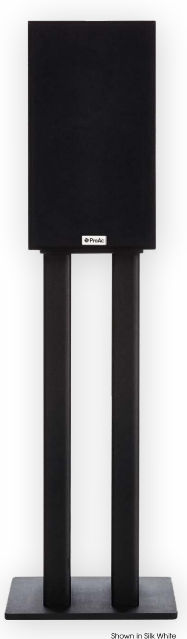
SHOWITH SHK WITH