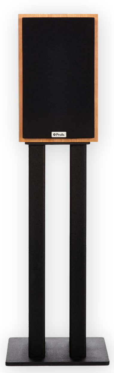
Shown in Cherry wood veneer

The new ProAc Tablette 10 is a tenth generation of the Tablettes launched in 1979. The Tablette 10 is an all new design, using a thin walled heavy damped infinite baffle enclosure which is the same as the BBC LS3/5a. This design allows the Tablette 10 to be positioned against a wall, unlike a ported enclosure (not recommended).