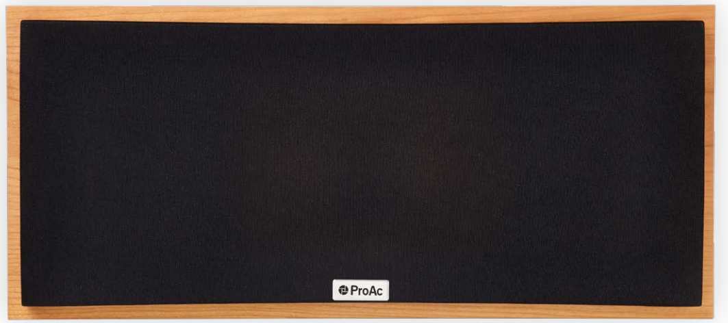
Shown in Cherry wood veneer