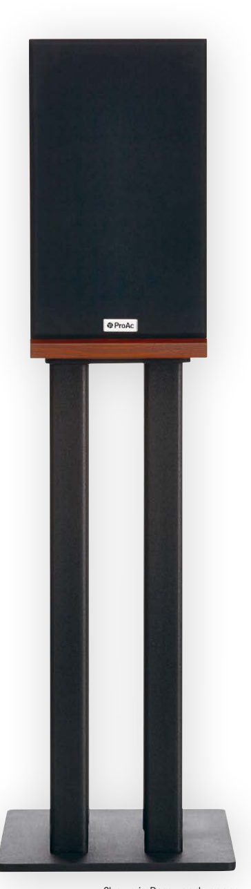
Shown in Rosewood veneer