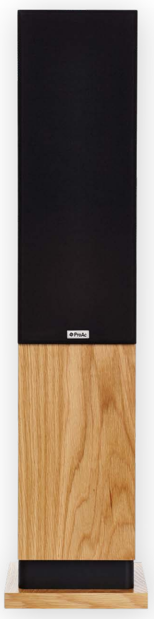
Shown in Natural Oak veneer

ProAc invests a great deal of time researching the choice of diaphragm material for their drive units because this is the most important component, transferring cone movement into sound. Some materials excel at certain frequencies and therefore it would prove logical to use more than one type of drive unit material to cover all frequencies. Additionally, all production parts from the chassis through to the magnet system, spider and voice coil are painstakingly selected.